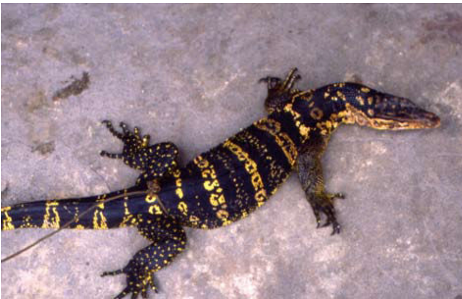
Fig. 5. This adult specimen of V. cumingi samarensis from Leyte Island shows the distinctive and rich in contrast dorsal color pattern.