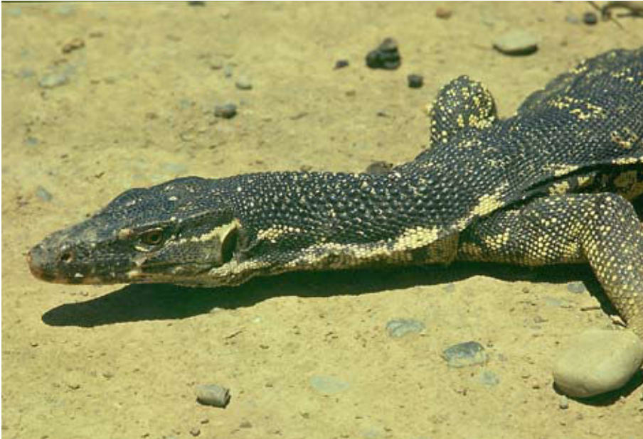
Fig. 4. The taxonomic status of the water monitor lizard population from Mindoro Island is still unsolved. This specimen shows enlarged nuchal scales as typical for V. marmoratus from Luzon.