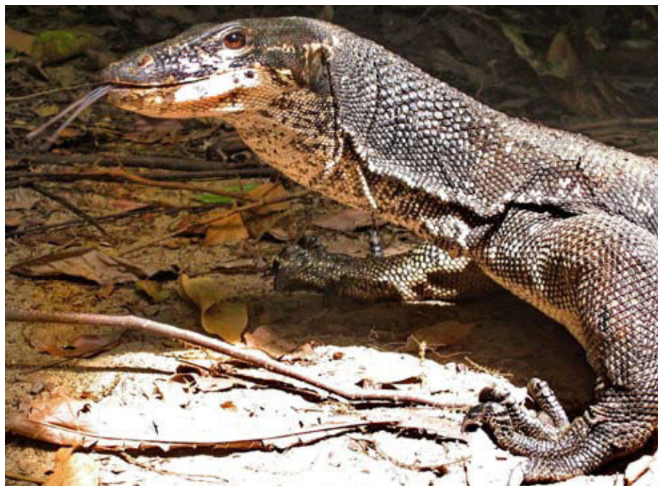
Fig. 2. Varanus palawanensis , one of the new monitor lizard species from Palawan Island.

Interestingly, the distribution ranges of the Philippine water monitor lizards reflect general biogeographic patterns of the Philippine Archipelago. Each species is endemic to one or few major modern-day islands constituting one of five faunistic subprovinces of the