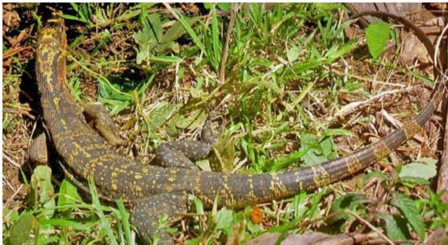
Fig. 7. The nominotypic subspecies of V. cumingi is restricted to Mindanao and some smaller offshore islands. Note the typical dorsal color pattern of indistinctive yellow transverse bands.

Finally, the recent revision of Philippine water monitor lizards is a convincing demonstration of the international importance of natural history museum collections as the archives of global biodiversity. Unfortunately, in times of limited public funding, necessary curatorial positions often remain unfilled once a scientist is retired. This gravely affects not only the relevant collections, but also the related field of study. Thus, one of the new monitor species, viz. V. rasmusseni (see Figs. 3A,B), which is known from only two specimens in the Zoological Museum of the University of Copenhagen (ZMUC), was named after the late Jens B. Rasmussen, former herpetologist in that museum, whose position was not reopened again. Thereby, the authors also want to call attention to the global taxonomy crisis.