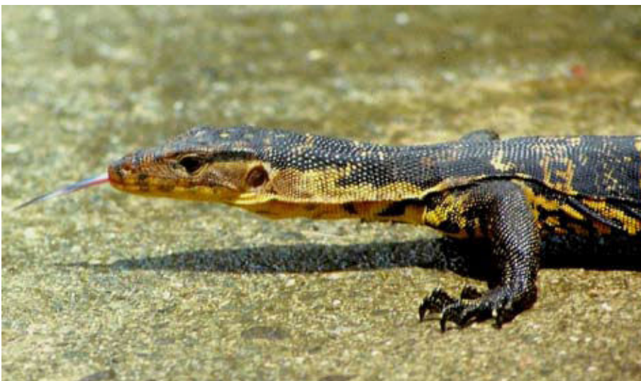
Fig. 6. A juvenile specimen of V. cumingi samarensis , the new subspecies of Cuming's water monitor from the islands of Samar, Leyte, and Bohol.